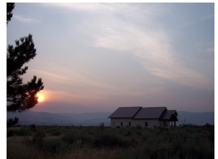
Mercy House at dawn

I never want to see the time here end, but one of the graces from this week is the thought that every moment forward, whether in joy or in sorrow, is one moment closer to eternity, where there is no time and where we will ever be in the presence of the Lord and never have to leave!